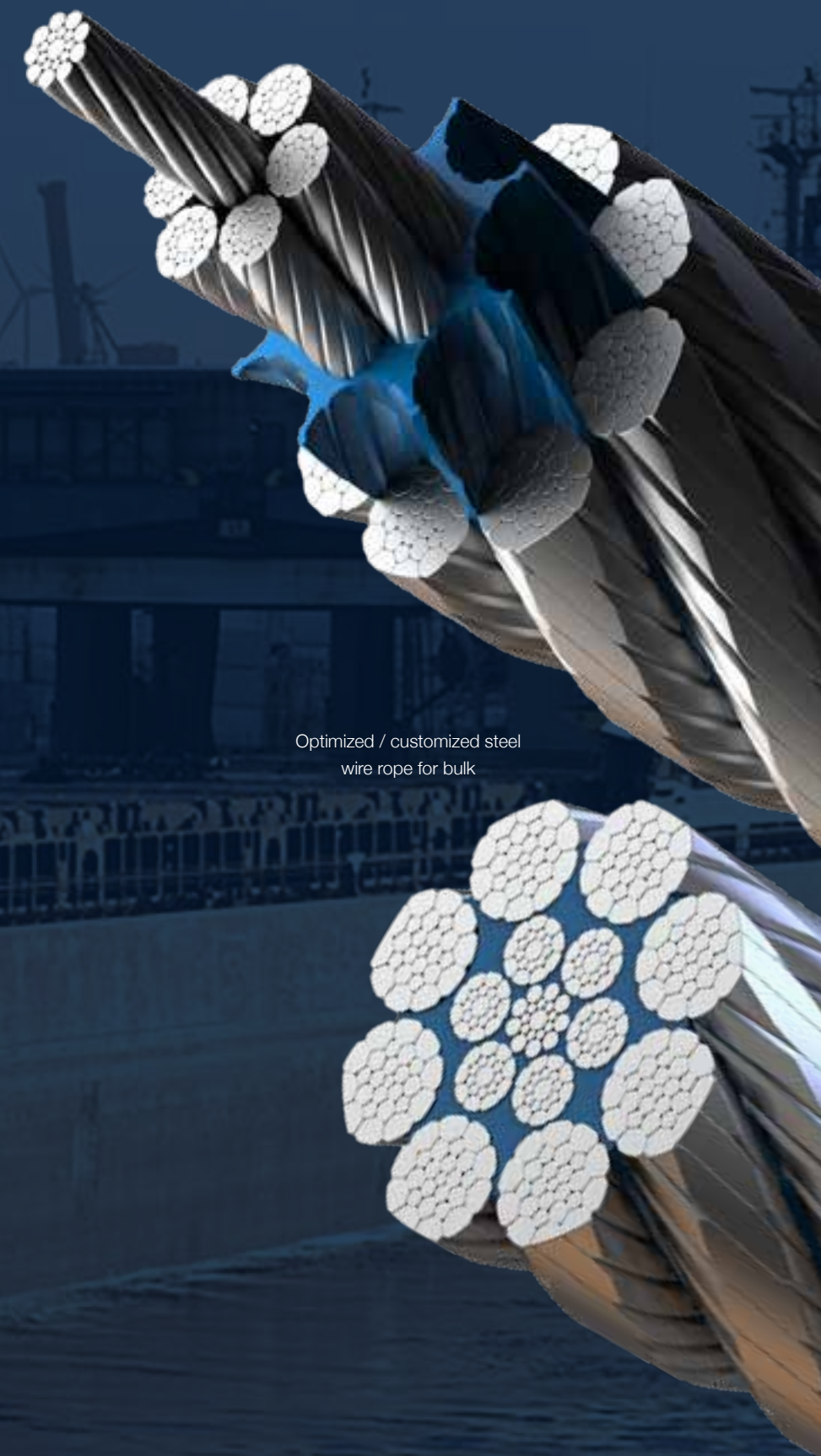
Optimized / customized steel wire rope for bulk