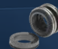
Rubber bellow seal