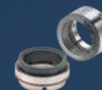
OEM mechanical seal