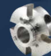
Cartridge mechanical seal