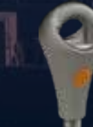
Rope Pear Socket

Proven reliability for safe and fast change over of grabs and other equipment. Our patented quick release link is designed to increase the productivity and safety of your organisation. The C-section, locking piece and a hexagonal key design guaranteeing a quick change over. A long lifespan under the most severe working conditions is guaranteed.