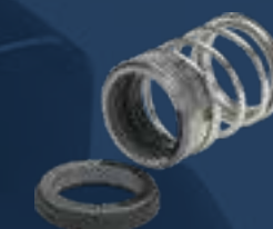
Component mechanical seal